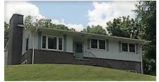
Rectory in Forest Hills