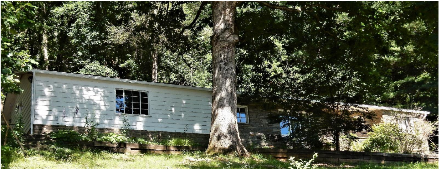
Canterbury House (above the church parking lot)