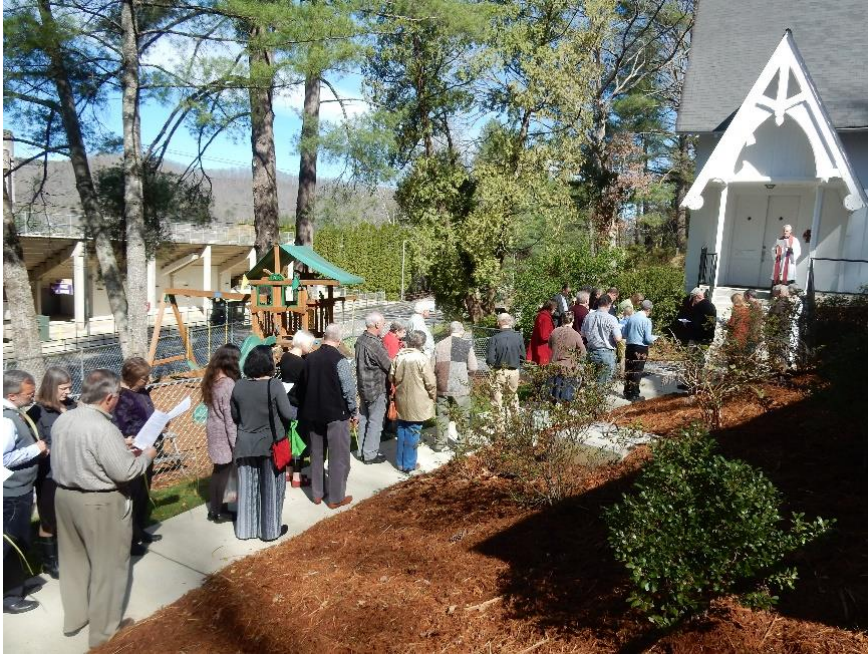
Palm Sunday Procession